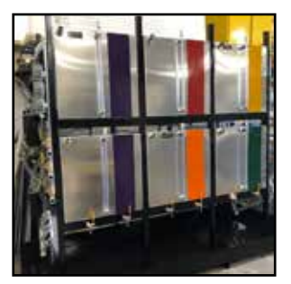
NOTE: FEATURED SYSTEMS SHOW PREVIOUSLY INSTALLED COMPONENTS AND CAN BE CUSTOMIZED / BUILT TO SIMILAR SPECS OF IFH SYSTEMS

Choice of motor(s), with option for pneumatic/air.