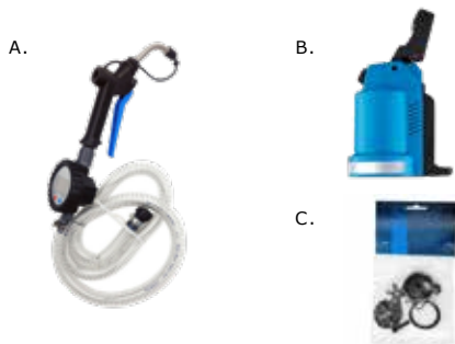
SHOWN: (A.) 5' METER GUN KIT, (B.) BOP POWER HEAD, (C.) IMPELLER AND SEAL KIT - ATF AND OIL